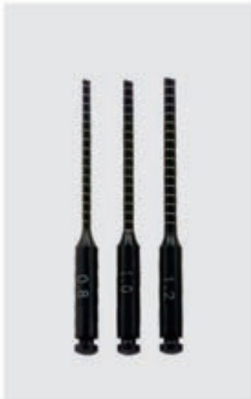
Trephine bur, L:17mm