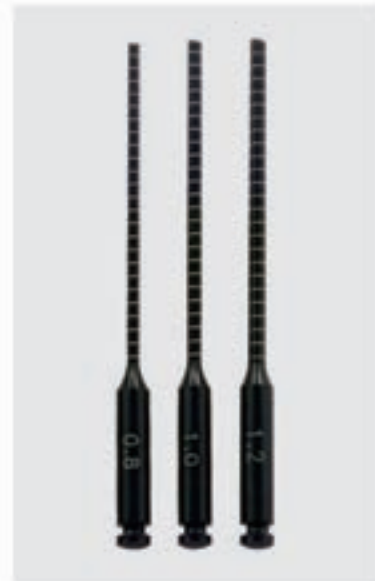
Trephine bur, L:25mm