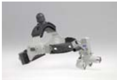
Wireless HL8000 Headlight combined with SLE Binocular Loupes