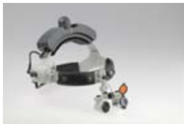
Wireless HL8300 Headlight combined with SLE Binocular Loupes