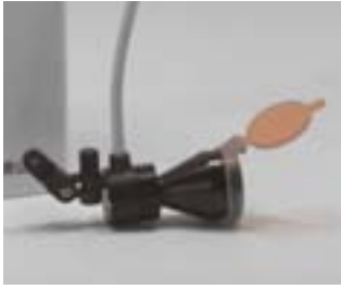
HL8200 Headlight (excluding the binocular loupes)