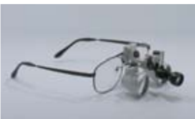
HL8200 Headlight combined with SLE Binocular Loupes