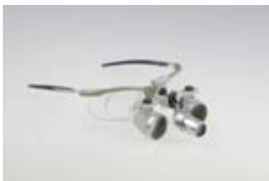
HL8300 Headlight combined with SLF Binocular Loupes