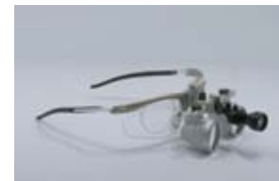
HL8200 Headlight combined with SLF Binocular Loupes