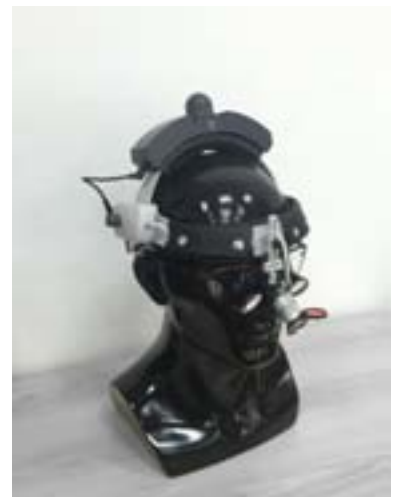
SLT Binocular Loupes with Wireless HL8300 Headlight