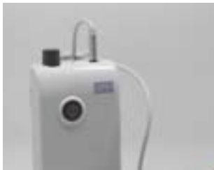
2300 mAh Battery Pack