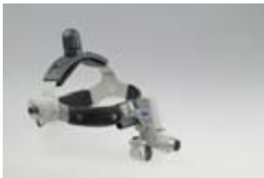
HL8000 Headlight combined with SLE Binocular Loupes