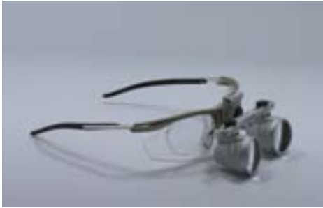
SLF Binocular Loupes (with sport frame)