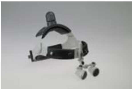
SLH Binocular Loupes (with headband)