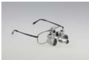
HL8300 Headlight combined with SLE Binocular Loupes