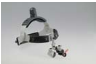
HL8200 Headlight combined with SLH Binocular Loupes