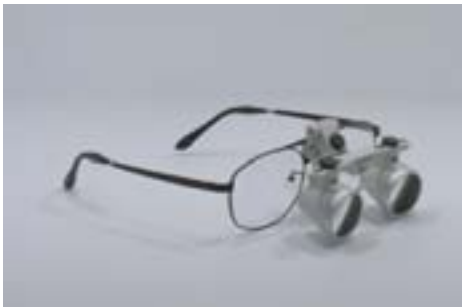
SLE Binocular Loupes (with Titanium frame)