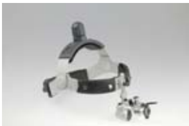
HL8300 Headlight combined with SLH Binocular Loupes