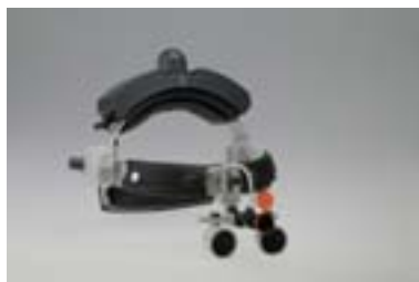
Wireless HL8200 Headlight combined with SLE Binocular Loupes