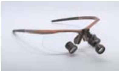
With TTL Loupes