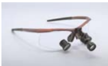
HL8200 Headlight combined with SLT Binocular Loupes (Sport Frame)