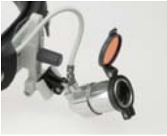
HL8300 Headlight (excluding the binocular loupes)