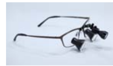
HL8200 Headlight combined with SLT Binocular Loupes (Titanium Frame)